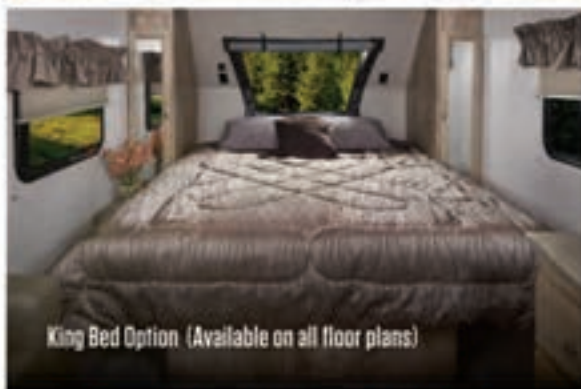
King Bed Option (Available on all floor plans)