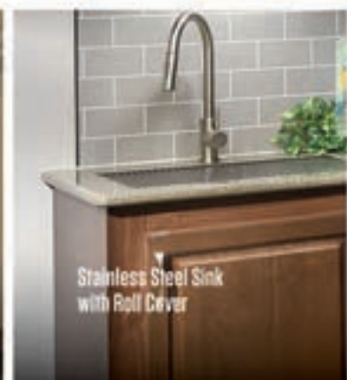
Stainless Steel Sink with Roll Cover