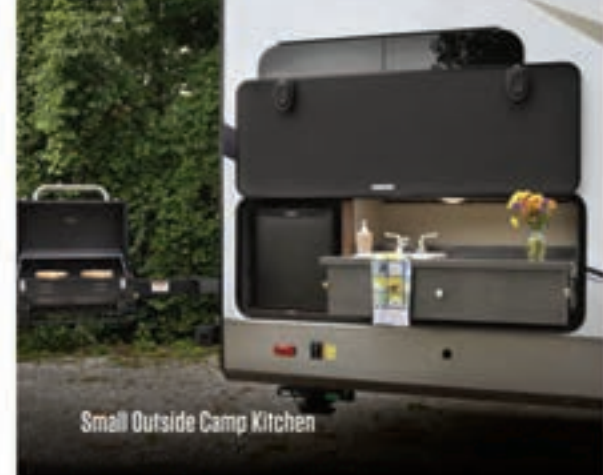
Small Outside Camp Kitchen