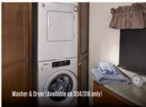
Washer & Dryer (Available on 304/316 only)