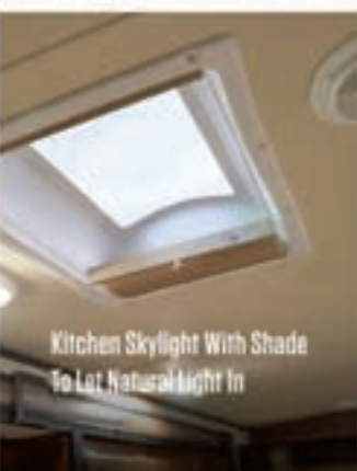
Kitchen Skylight With Shade To Let Natural Light In