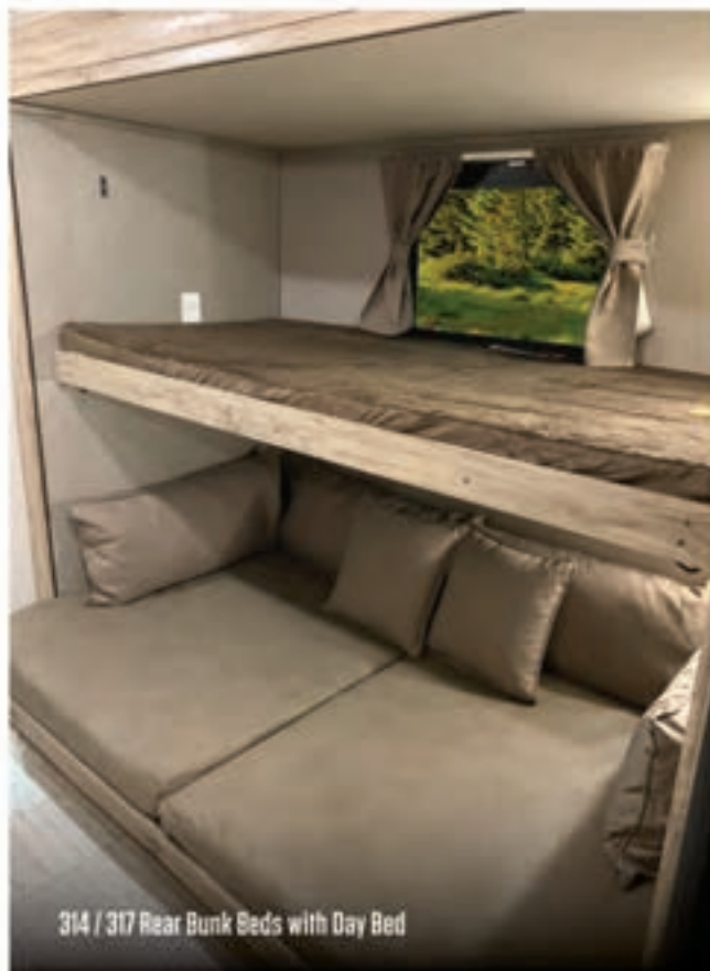
314 / 317 Rear Bunk Beds with Day Bed