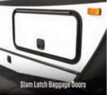
Slam Latch Baggage Doors