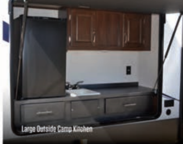
Large Outside Camp Kitchen