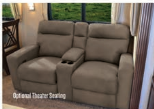
Optional Theater Seating