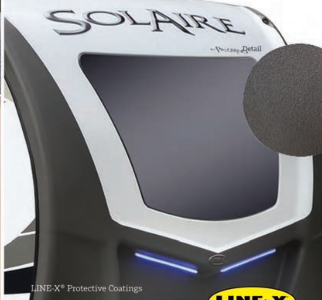
LINE-X® Protective Coatings