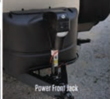
Power Front Jack