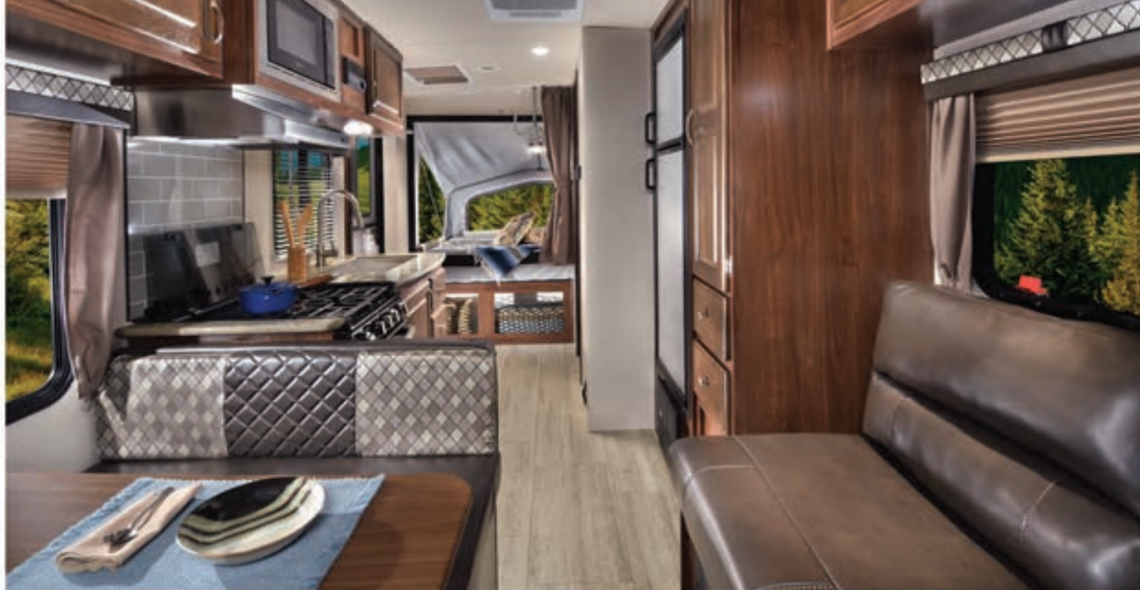
163X WITH GRANITE INTERIOR DECOR AND WALNUT CABINETS