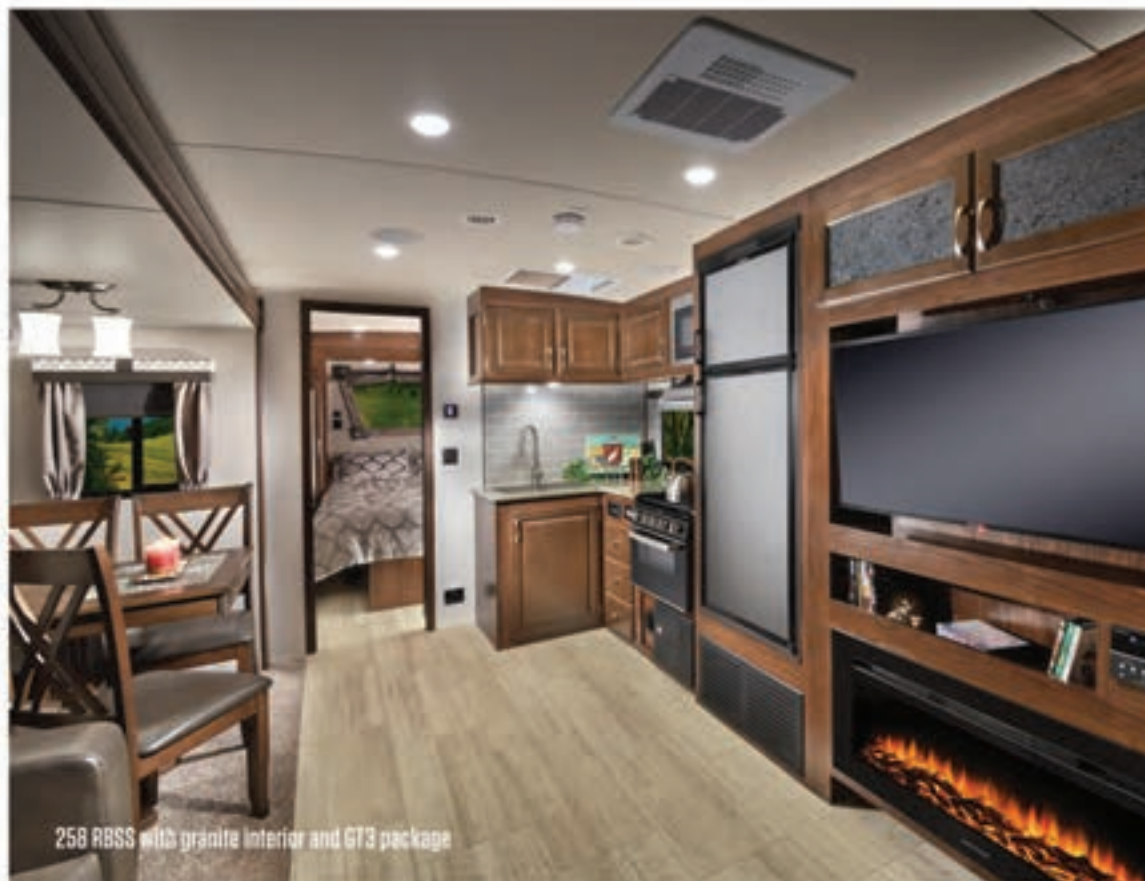
258 RBSS with granite interior and G73 package