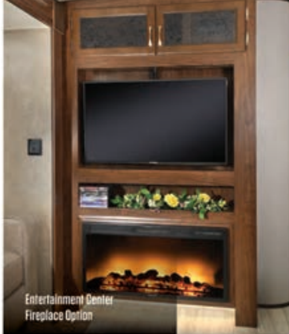
Entertainment Center Fireplace Option