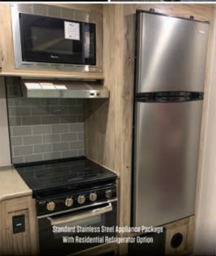
Standard Stainless Steel Appliance Package With Residential Refrigerator Option